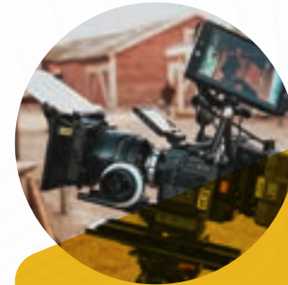
Film Making Club