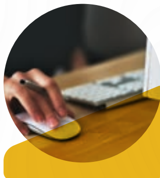
Computer Science Society