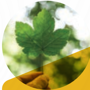
Environment Protection Society